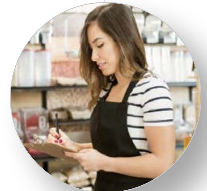
Pharmacies and Convenience Stores